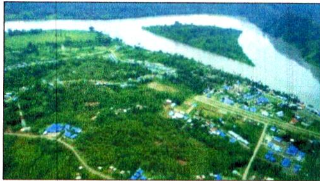
Figure 2. Lowland morphology.

conglomerate, elevation 50 m to 75 m above sea level, the slope between 10% to 12%. Fracture morphology control is spreading in the Middle East Mamberamo, Mamberamo Hulu and Roufaer, west and southeast Mamberamo, Burmeso, Kasonaweja with the general direction North-Northwest-South-Southeast and Southwest-Northeast.